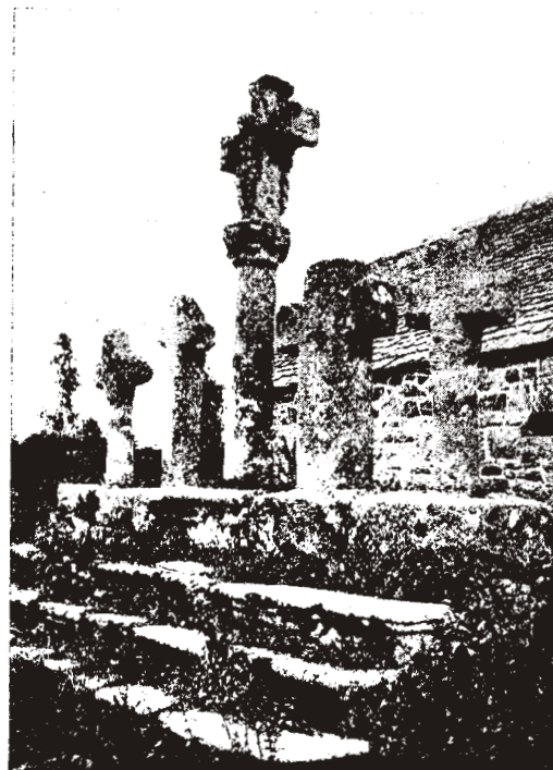
THE FIVE CROSSES AT PLOUBÉZÉRÉ, NEAR LANNION, Côtes-du-Nord, Brittany.

There are two words used of the "other" and "others" in John 19. 32 and Luke 23. 32 (see Ap. 124. 1). In the